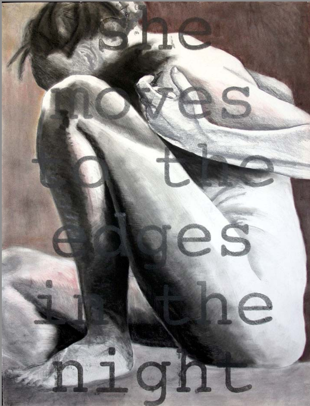
Body/Text, 40x50 inches mixed media drawing, 1992-2007