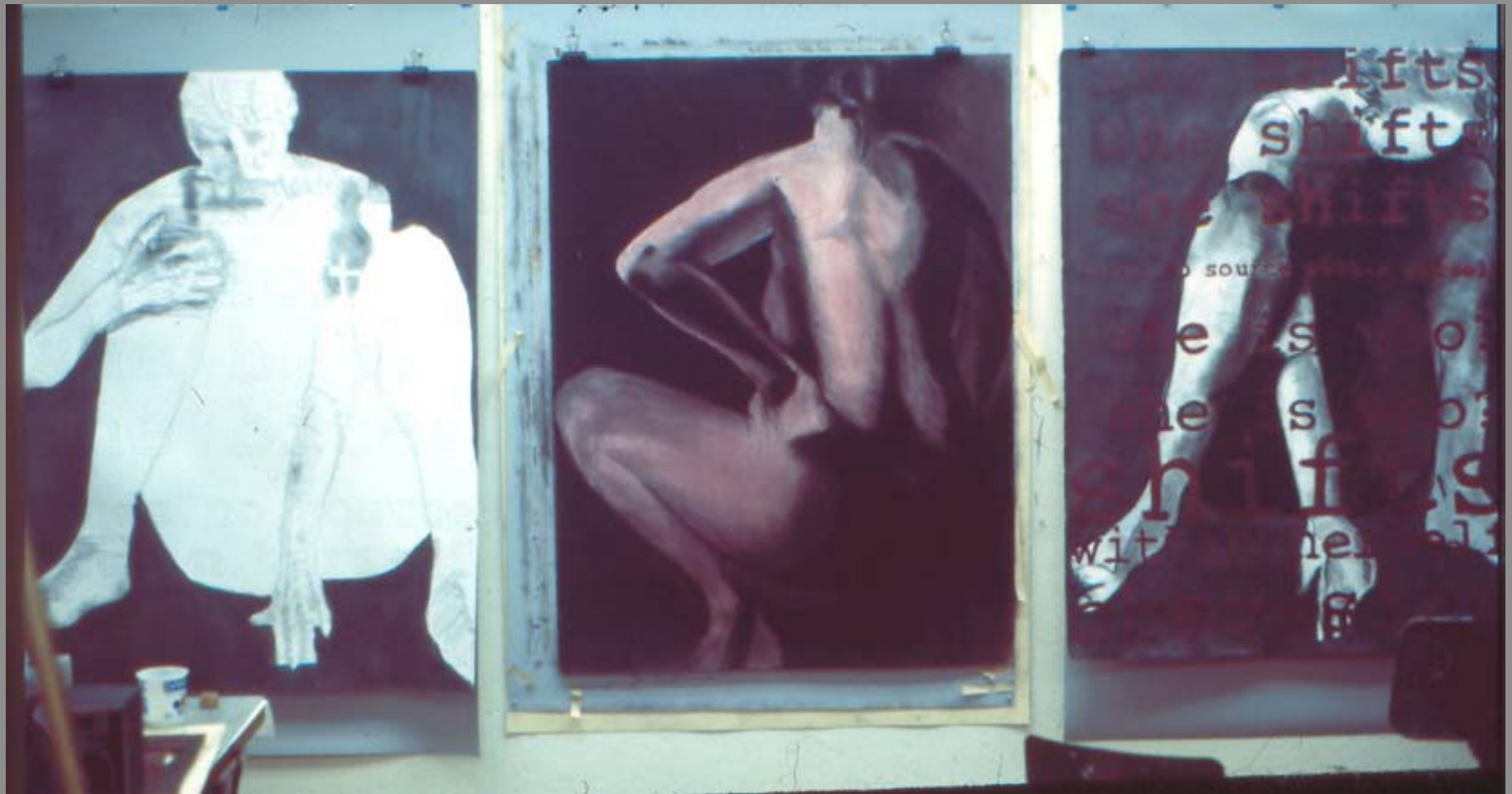
Studio, with work-in-progress (1998)