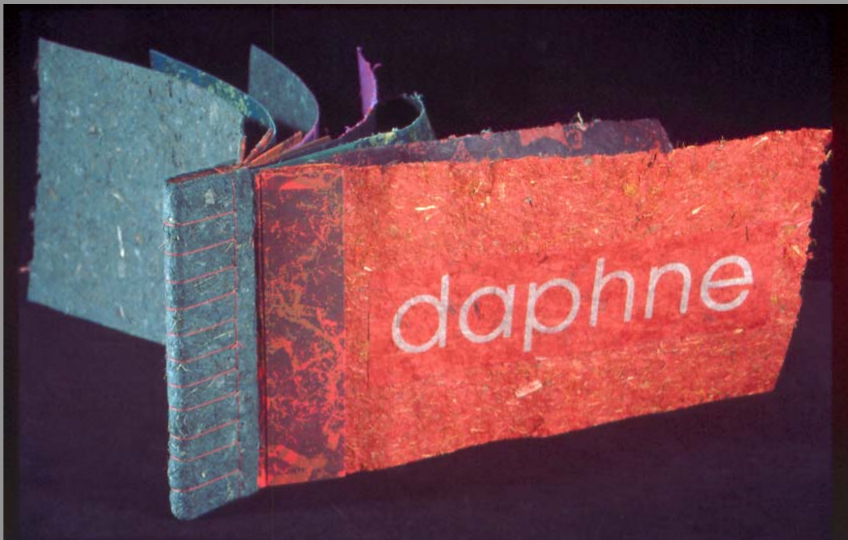
daphne , artist book, 14x25 inches, silk screen and collage, 1997