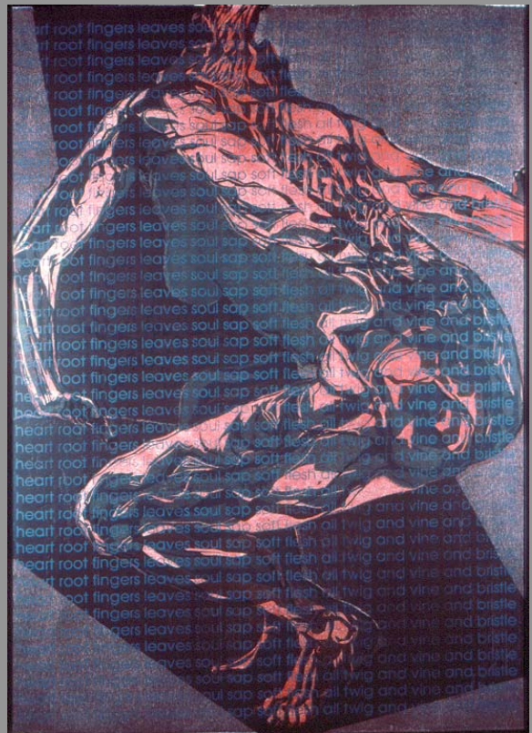
daphne , prints in installation 50x120 inches