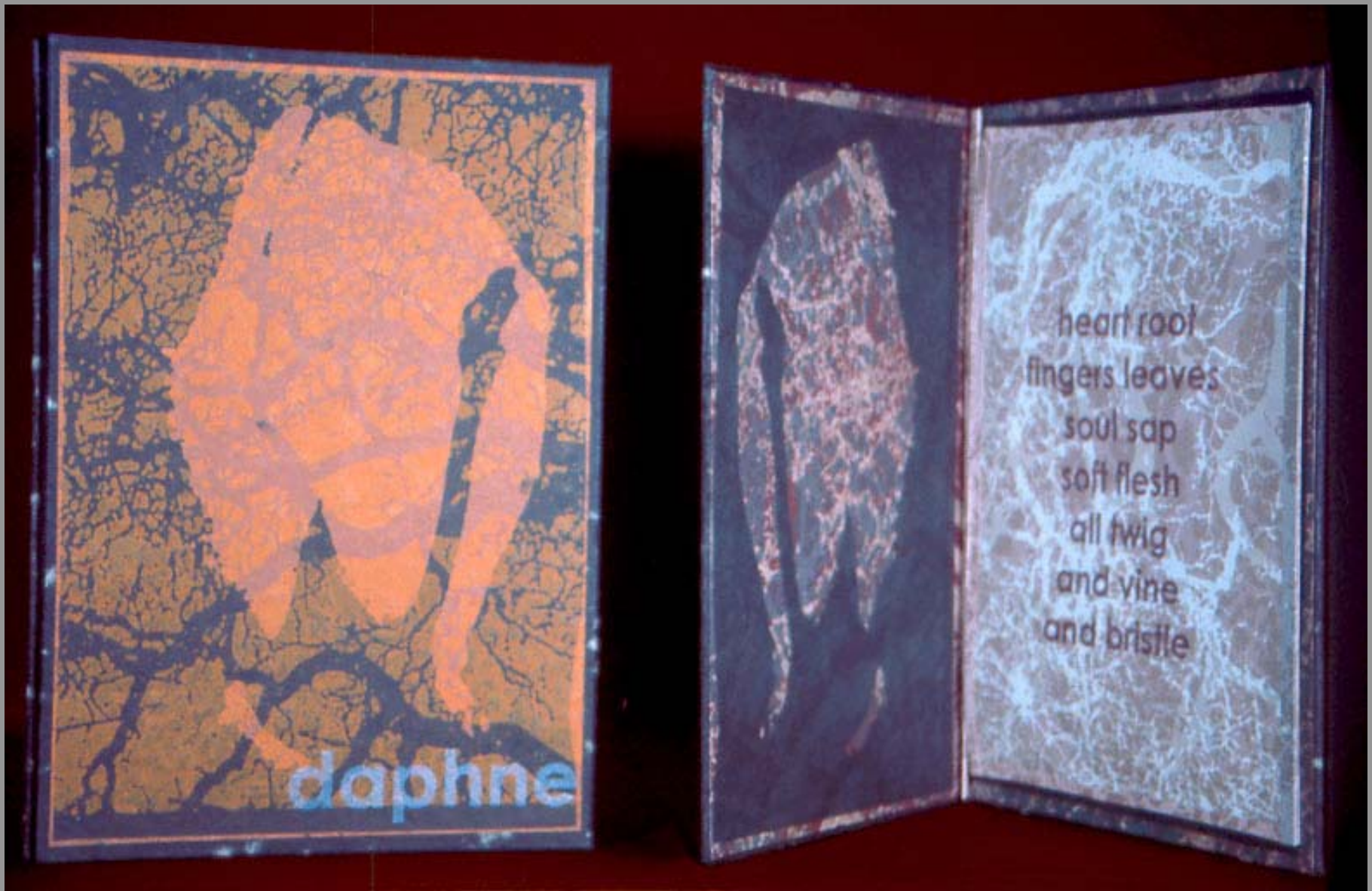
daphne , artist books, 9x12 silkscreen, 1999