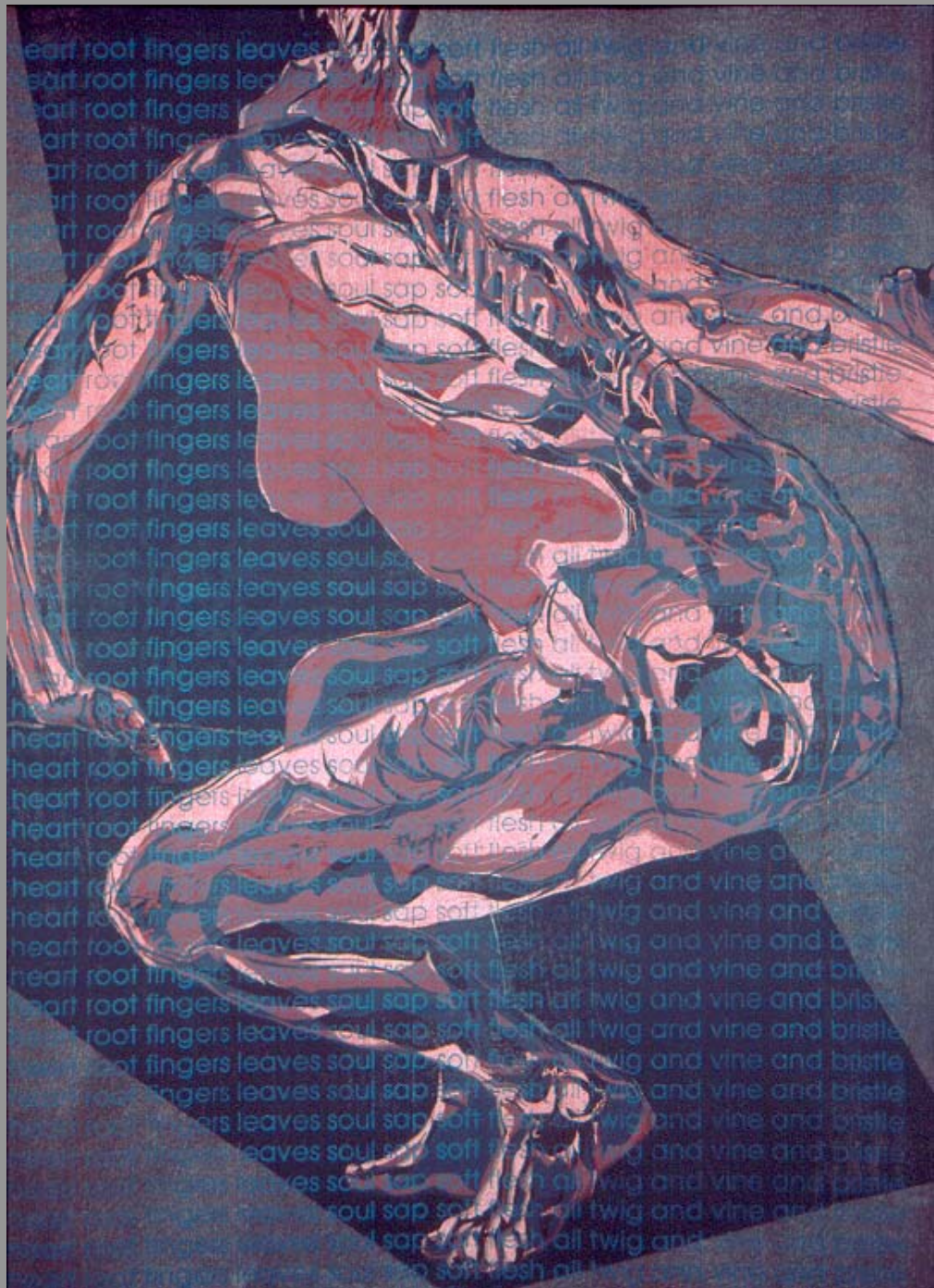
daphne , woodcut and xerox transfer, 40x50 inches, 1997