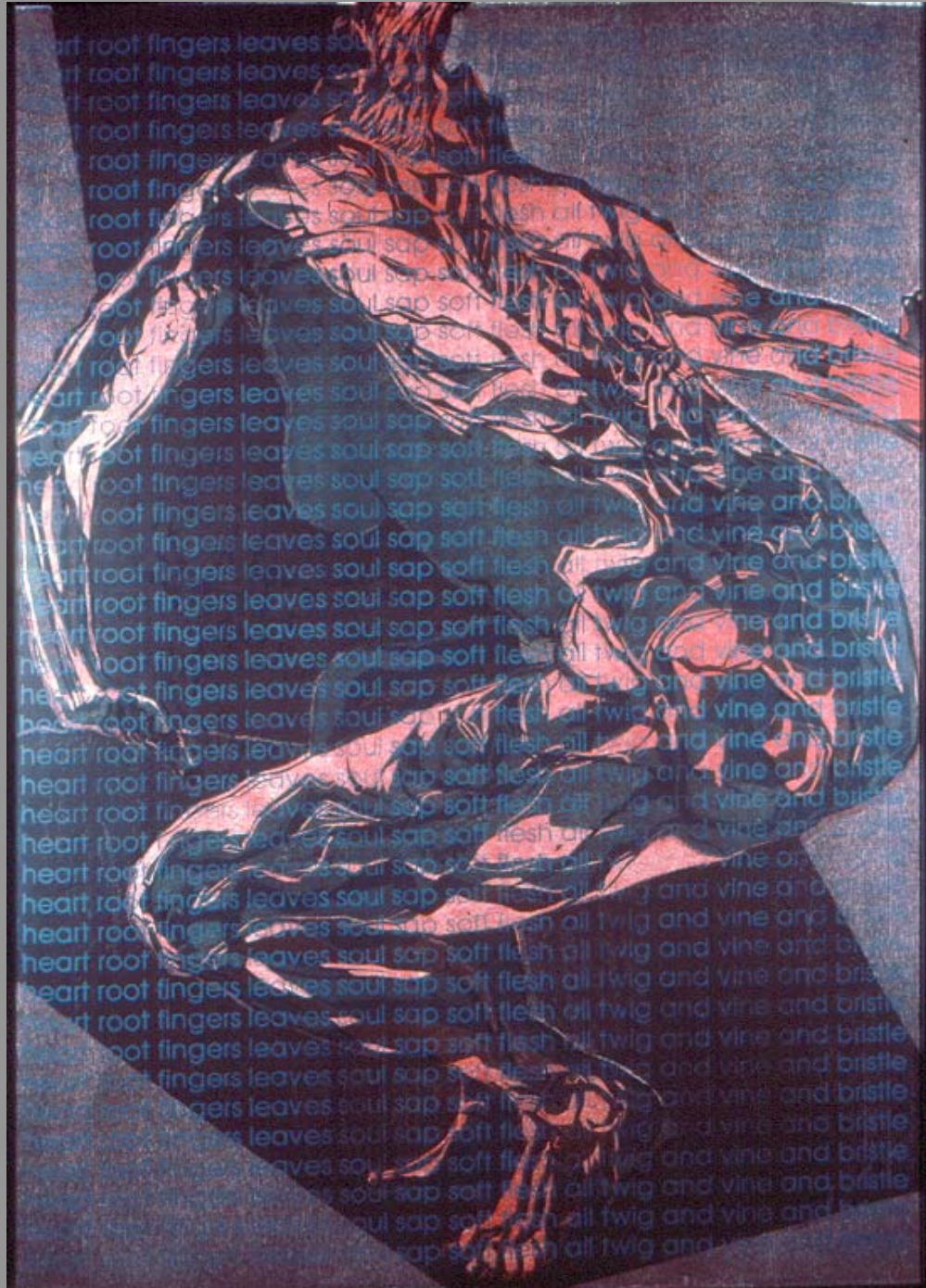
daphne , woodcut and xerox transfer, 40x50 inches, 1997