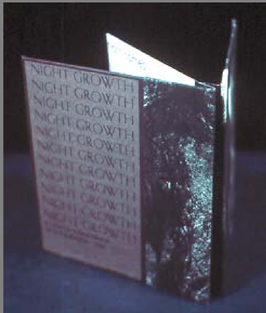
NIGHT GROWTH , etching, collage and digital text, 12x18 inches, sewn in page, 1998