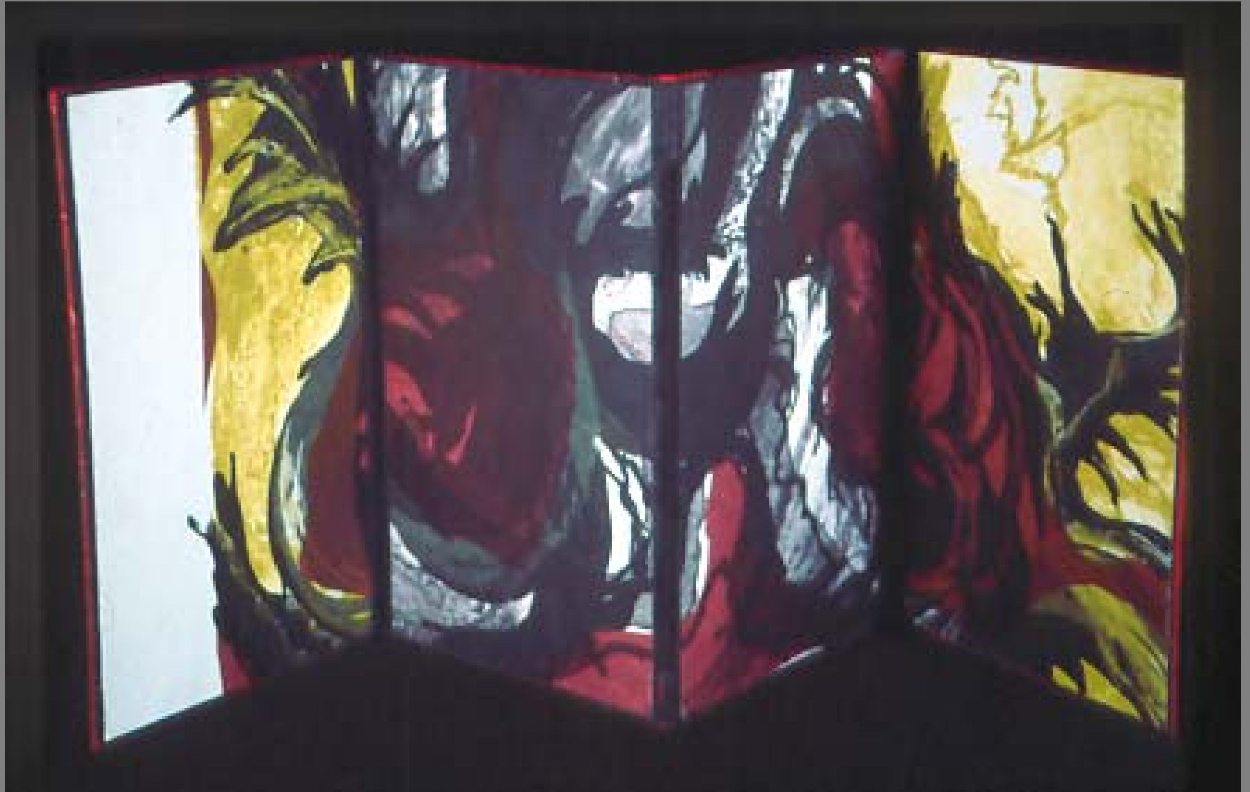
night growth , lithography and monoprint, 8x18inches, accordion book, 2001