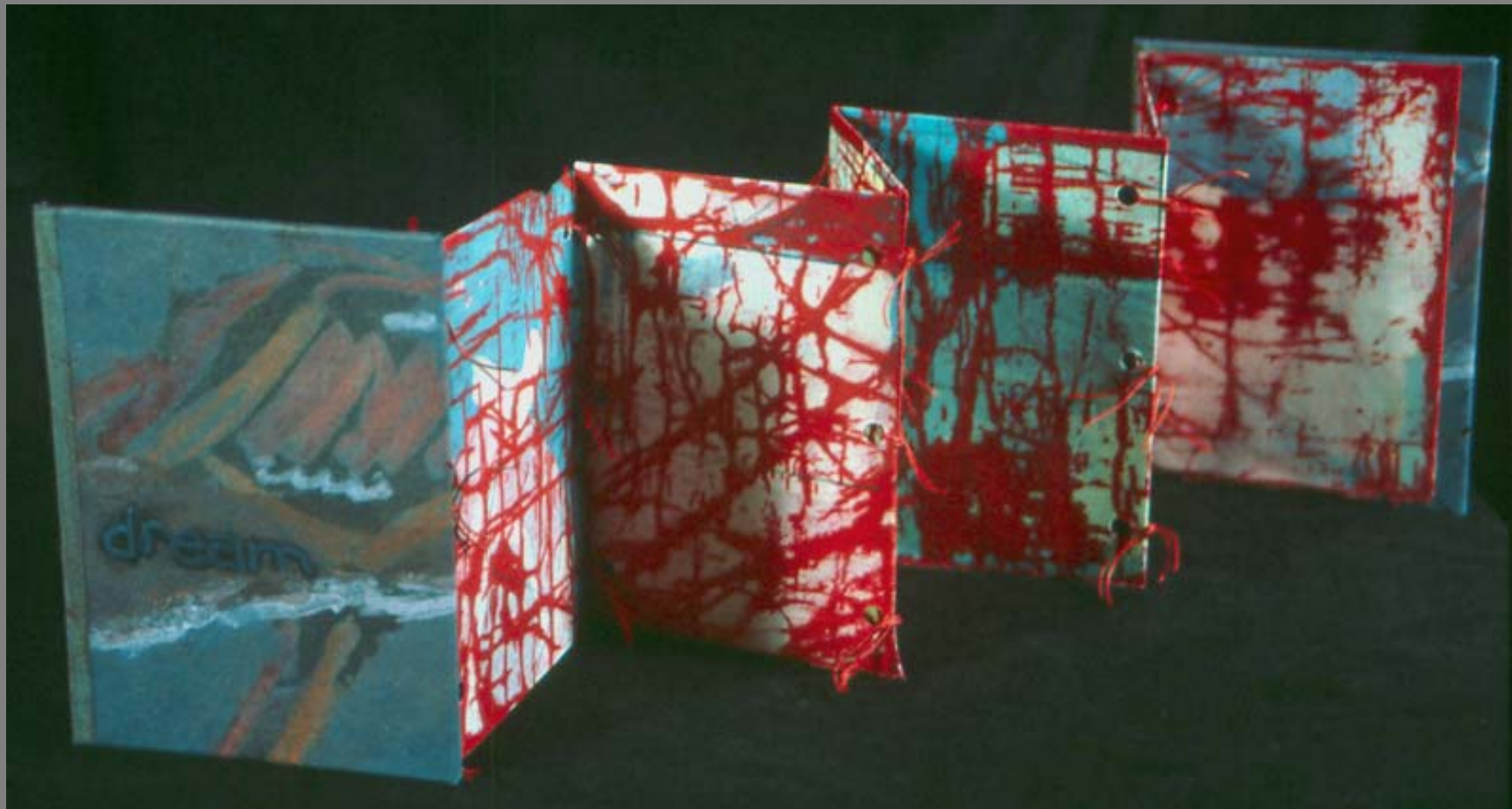
dream , wax batik and monoprint, 6x36inches, 2000