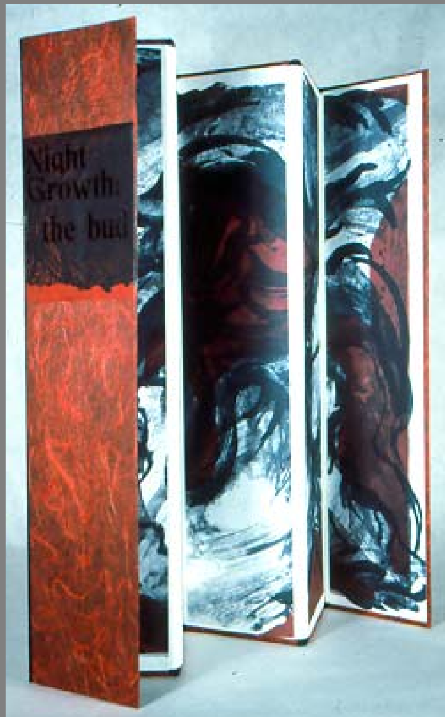
Night growth:: the bud , lithography and letter press 18x20 inches, accordion book, 2005