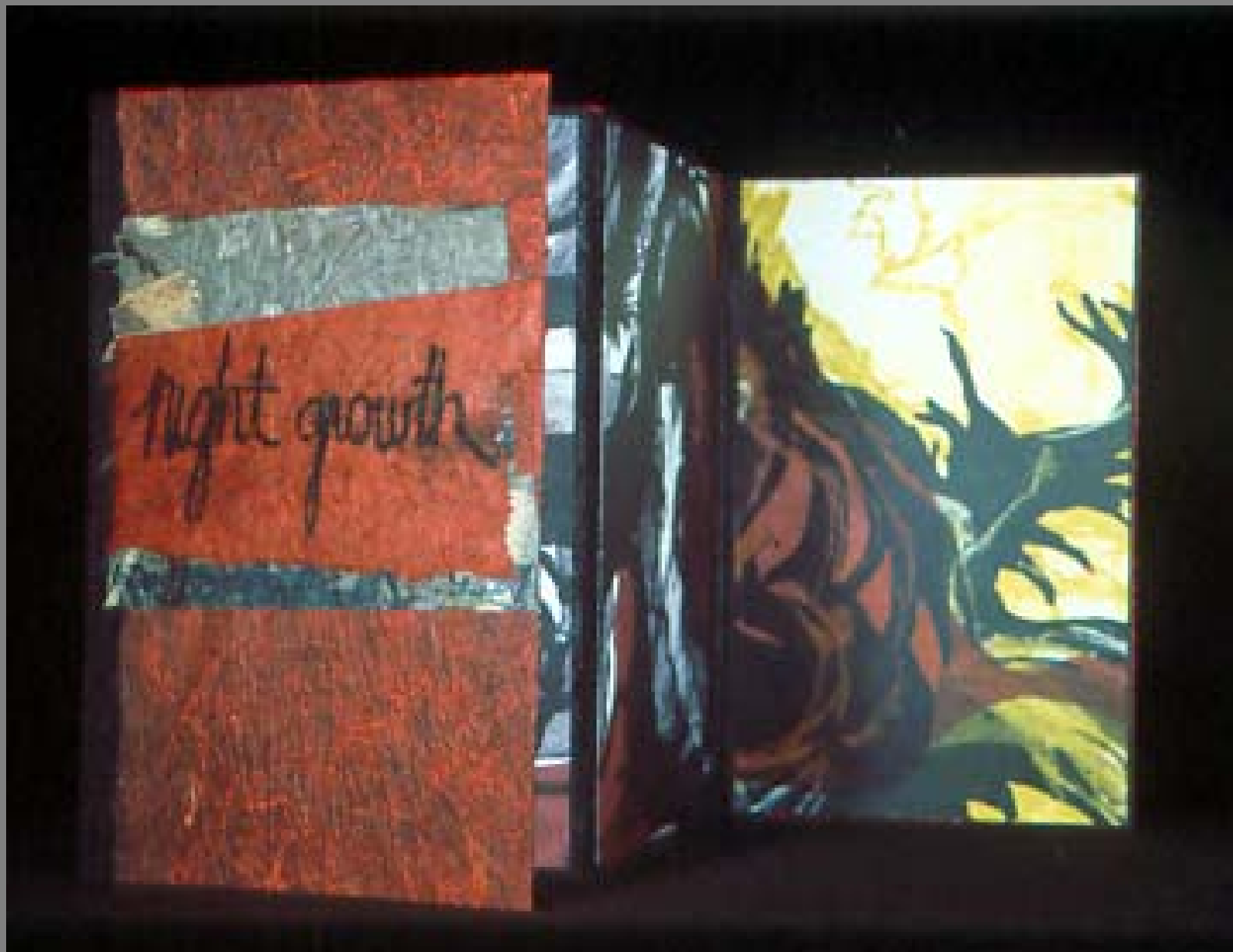
night growth , lithography and monoprint, 8x18inches, accordion book, 2001